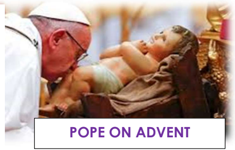
POPE ON ADVENT

Jesus' invitation is this: raise your head high and keep your hearts light and awake. Indeed, many of Jesus' contemporaries, faced with the catastrophic events they saw happening around them – persecutions, conflicts, natural disasters – are gripped by anxiety be